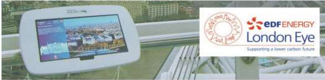
Digital Cityscapes flying high on the London Eye