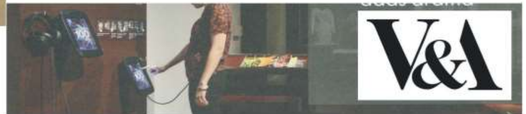
New V&A theatre app adds drama to galleries