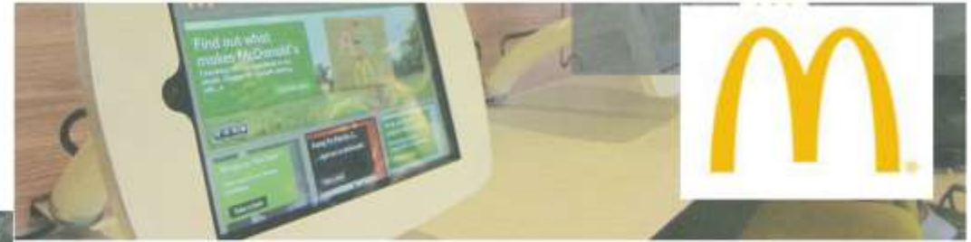
Big Mac, fries and a tablet full of apps, please