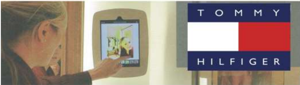
Share a photo selfies on changing room iPads