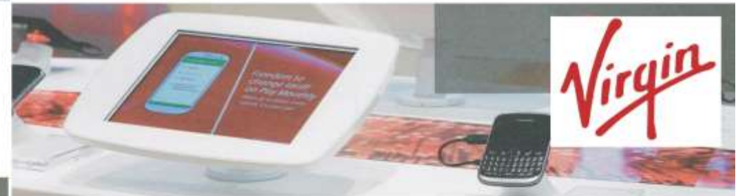
Virgin Media store dressed as tablet home of the future