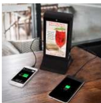
Increase Dwell & UP Sell More Money in your till